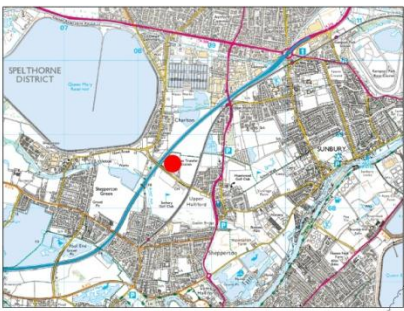
LOCATION PLAN, SCALE 1:50,000 @A1